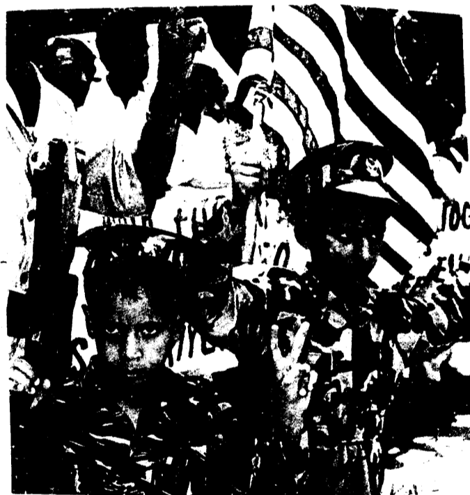
Result of Islamic indoctrination:- Muslim children with guns.

Allahwale Organisation holds its annual congregations at Bhopal at Taju'l-Masjid, one of the largest mosques in Asia. Thousands of Kashmiri members of Allahwale would interact with other members during the congregations. This helped them in establishing strong links with Indian chapter