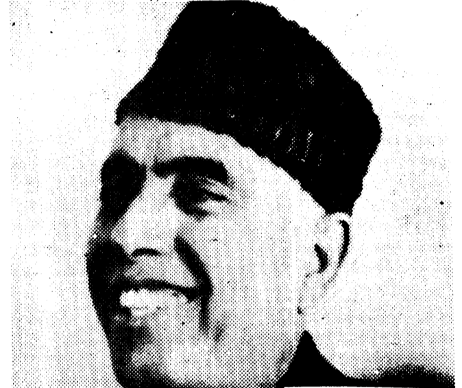
Sheikh Mohd. Abdullah

The military plan was prepared by General Akhtar Malik, GOC 12 Division. On May 13, 1965 a meeting was held at Murree. In this meeting besides