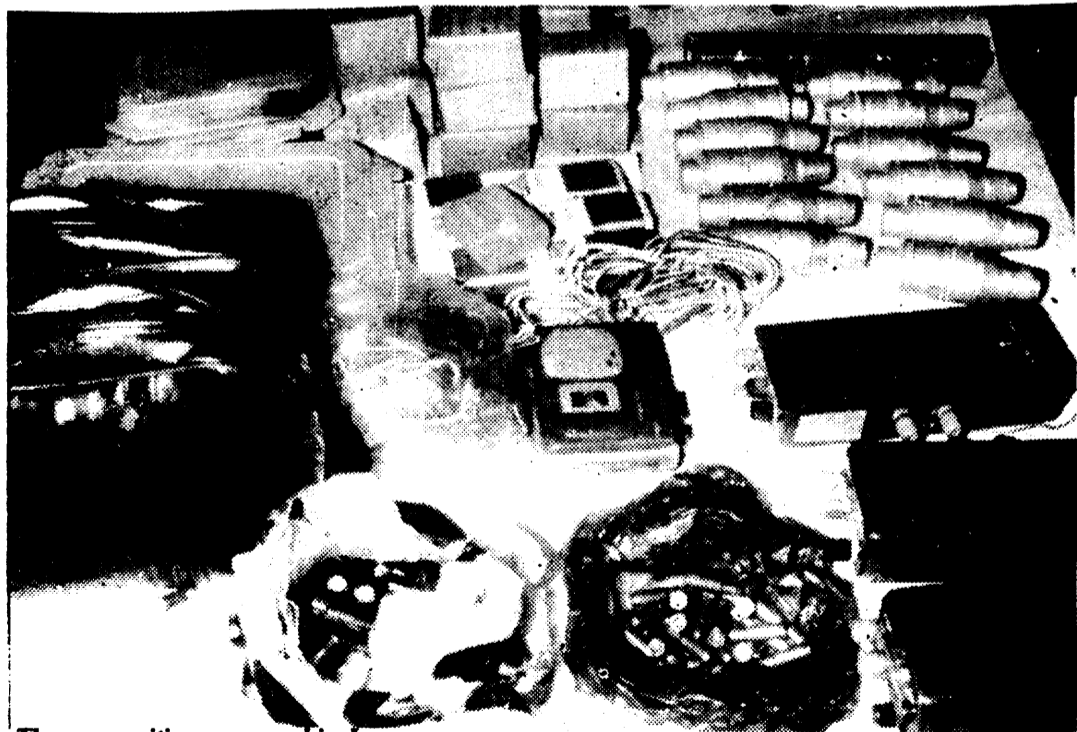
The ammunition recovered in Jammu.

The report mentions that the State government has also failed to recover taxes which amount to Rs 359 crores. Sale Tax arrears alone amount to Rs 331 crores. The State government also granted exemption from payment of Sales Tax to the small scale industrial units by issuing incorrect certificates of registration. This irregular exemption led to the loss of Rs 4.08 crores to the State government. The CAG report mentions that the State government spent Rs 3712.12 crore in excess of budget provisions, reflecting inadequacies of the budgetary control mechanism.