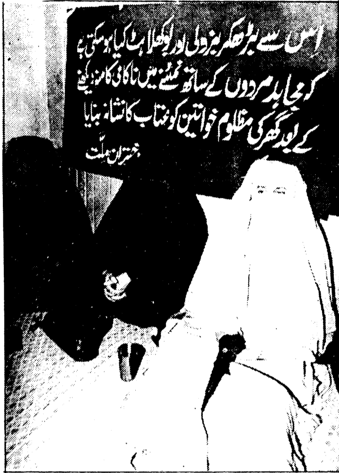
Muslim Women take a lead in insurgency in Kashmir: Dukhatran-e-Millat press conference.

damentalism and sectarian modes of the separatist movement on the social personality and psychology has been considerable. The youth which has been schooled mostly in Jamaat institutions is highly indoctrinated with the ideology of sectarianism and fundamentalism.