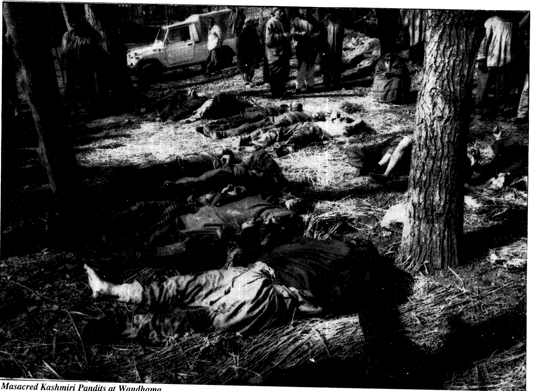
Masacred Kashmiri Pandits at Wandhama

Largest Circulated English Fortnightly of J&K