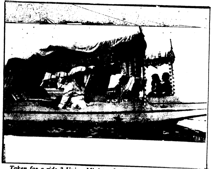
Taken for a ride? Union Minister for Tourism, Mr ML Khurana enjoying a shikara ride during his visit to the Dal Lake.

Intellectual sections of the displaced Pandits are however disturbed more by a different trend in the BJP-RSS circles. They allege that within RSS-BJP circles frequent reference are made to the failures of Nehru-Gandhi ideology. They also allege that disdainful references are also made towards coterie of Kashmiri Pandits Civil Servants who rose to eminence during the Nehru-Gandhi era. "In fact, anti-Nehruvian rhetoric of Sangh Parivaar reflects some times as an anti Kashmiri Pandit attitude. If somebody in Sangh thinks that KPs were responsible for the emergence of Nehru or Indira Gandhi or KPs were the beneficia-