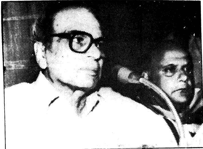
Sh. Jagmohan addressing a Press Conference in Jammu.